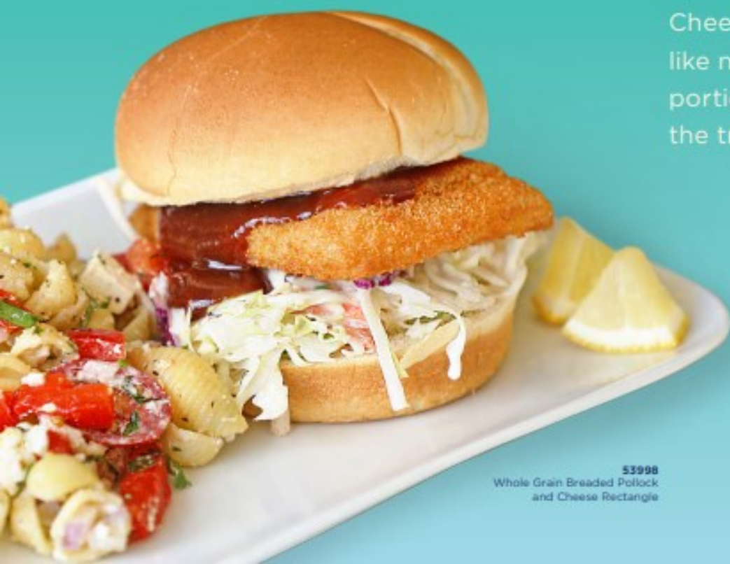
53998 Whole Grain Breaded Pollock and Cheese Rectangle

Our Wild Alaska (frozen one time only) seafood tastes great, is nutritional, and is easy to prepare. With flavor options like Nacho, Potato Crusted, and Cheese along with new shapes like nuggets, bites, and sandwich portions you don't have to offer the traditional fish stick.